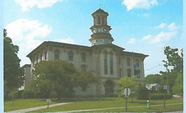
WYOMING COUNTY – FOUNDED IN 1843