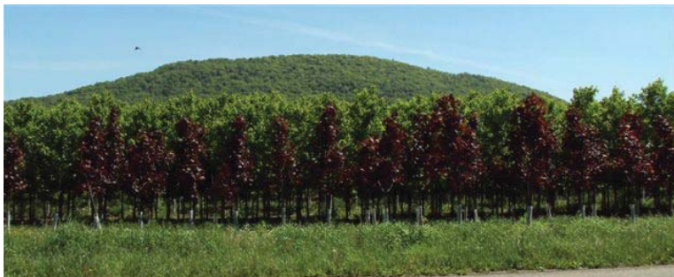
Wolk's Tree Farm, Sugarloaf Township

Through the Luzerne County Farmland Preservation Program, the farms with the best soils will be used to grow crops rather than houses or other kinds of development. Once a farm with Capability Class Soils I-IV has been paved over to build homes, those high quality soils are lost forever. Agriculture has always been vital to the economy of the County, and it supports a solid infrastructure of related agribusinesses in Luzerne and surrounding counties. The inherent value of farmland goes beyond its economic value